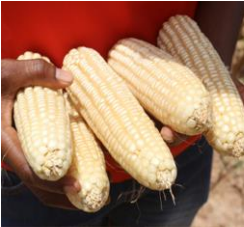
Figure 2: CSIR-Similenu, a climate-smart hybrid maize variety