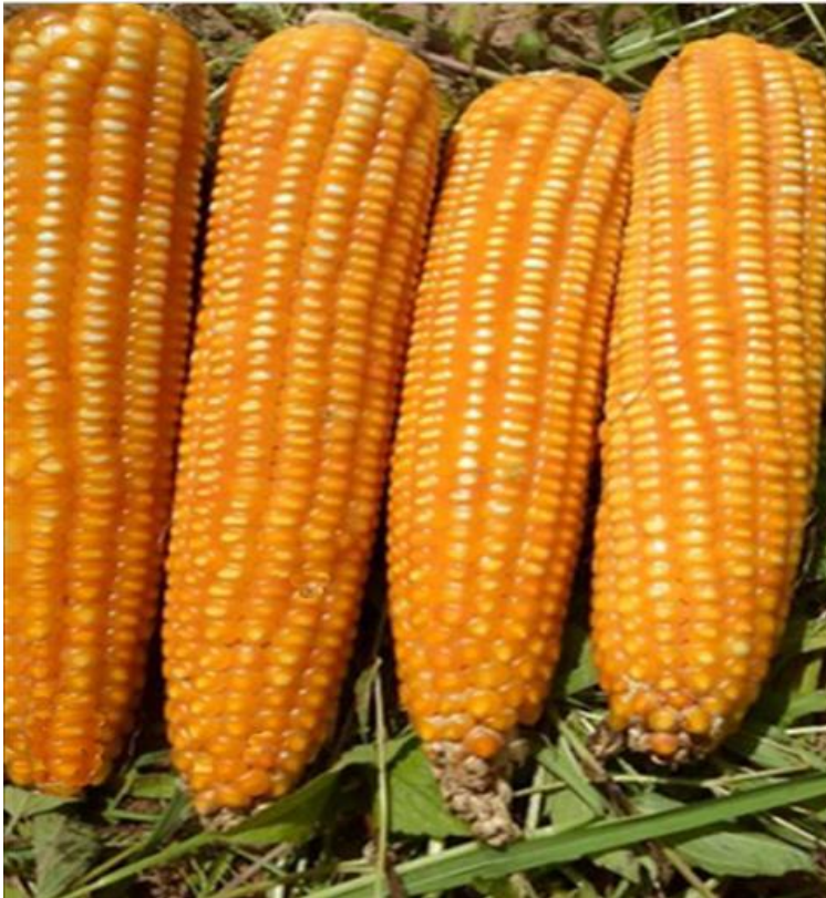
Figure 2: CSIR-DENBEA, a climate-smart hybrid maize variety