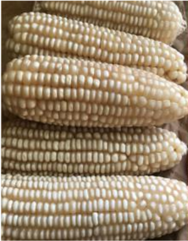
Figure 2 : CSIR- Kum - naa - ya, a climate-smart hybrid maize variety